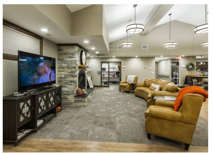
The "Gathering place" lounge where residents can watch their favorite shows.