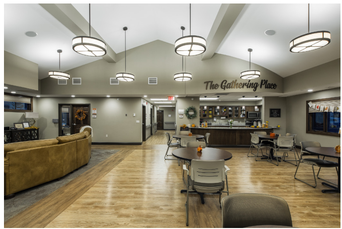
The "Gathering Place" great room for activities and local events.