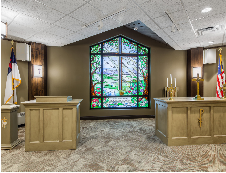
The focal point of the new chapel is the altar, surrounded by a stained-glass window from a local artist.

After initial planning, MCHC evaluated the immediate needs of the community and, based on highest demands for more assisted living accommodations, they moved ahead with a new facility called Rosen Place on 8th. Assisted living facilities are more commonly located in larger towns, requiring seniors to move