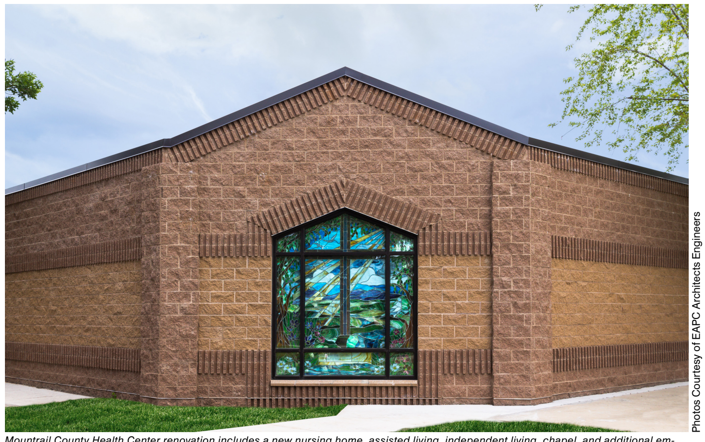
Mountrail County Health Center renovation includes a new nursing home, assisted living, independent living, chapel, and additional employee parking.

ountrail County Health Center (MCHC), in Stanley, Mountrail County, North Dakota, is an integrated healthcare system campus, and includes a hospital (Mountrail County Medical Center), clinic, nursing home (Bethel Home), independent living apartments (Centennial Court), and an aquatic center.