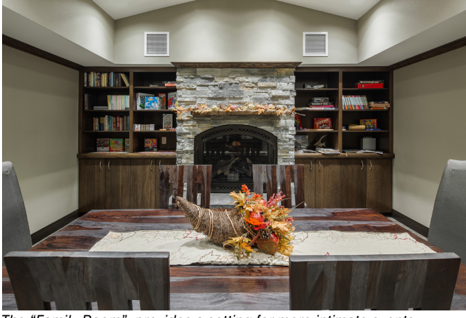
The "Family Room" provides a setting for more intimate events.