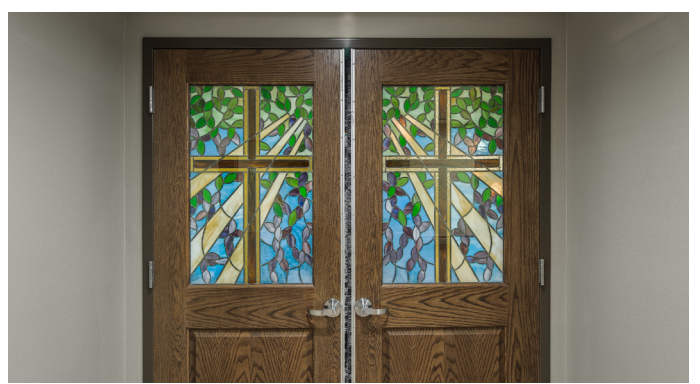
Stain glass doors offer inspiration for both entering and leaving.

The MCHC facility administrators also proceeded with a new chapel during the same construction period, to satisfy the request of community members who had helped raise funds for a new and larger chapel at the Mountrail Bethel Home. The new 3,000-square-foot Bethel Chapel addition is located to the north of the Bethel home activities room in the current courtyard. It accommodates seating for 50 people. The focal point of the chapel is the altar, which is surrounded by a beautiful stained-glass window designed by a local artist, with assistance from a local group. This addition