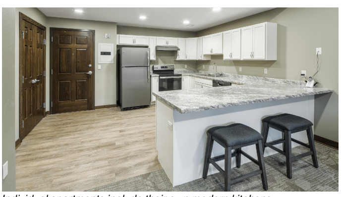
Individual apartments include their own modern kitchens.

also features a new boardroom that has been set up to also act as the chapel overflow via audio/video equipment, should the need arise to serve a large audience.